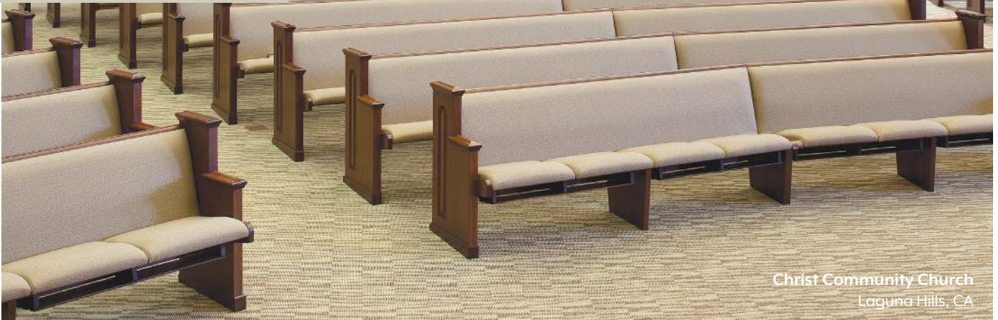
Christ Community Church Laguna Hills, CA