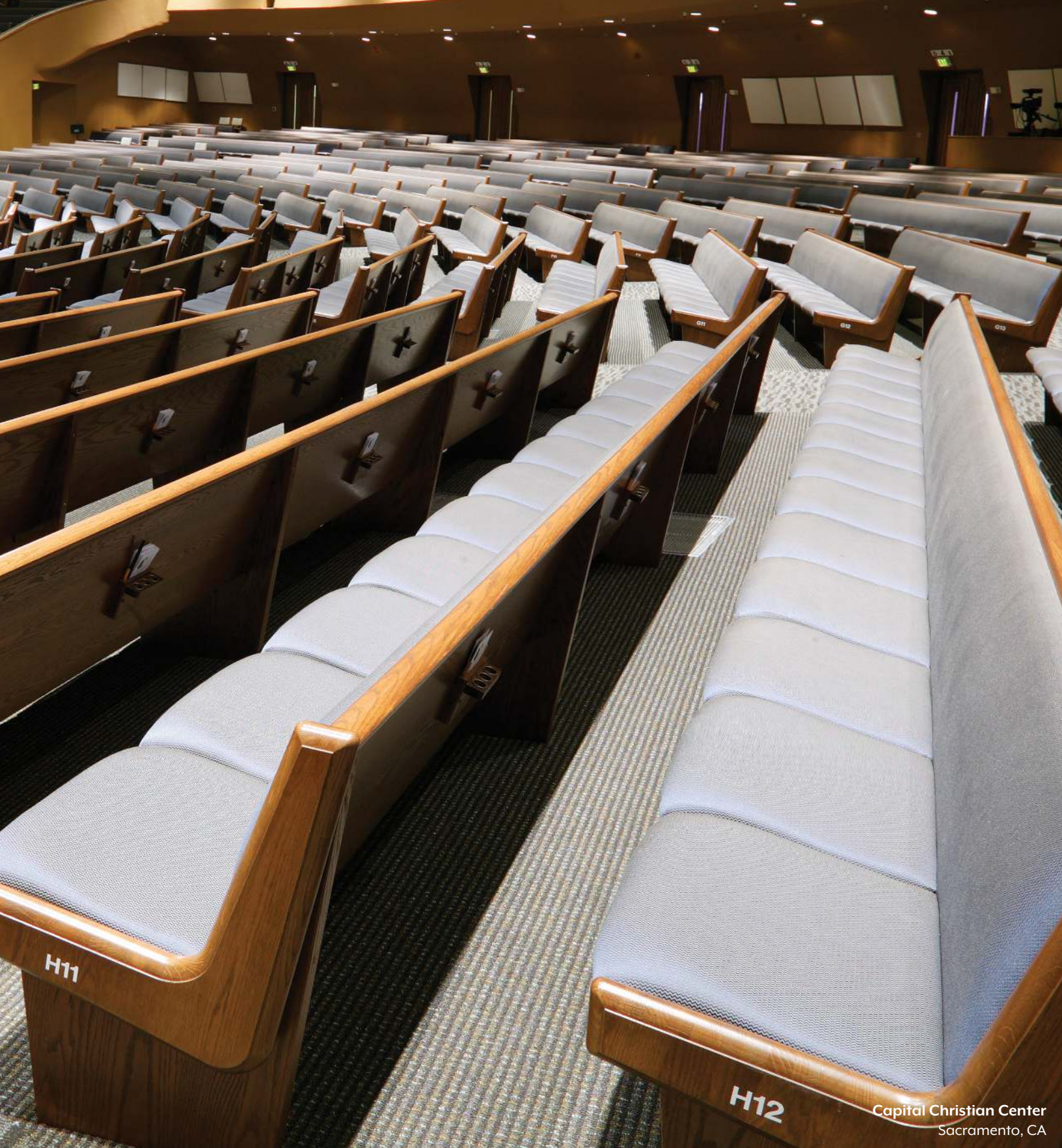
Capital Christian Center Sacramento, CA