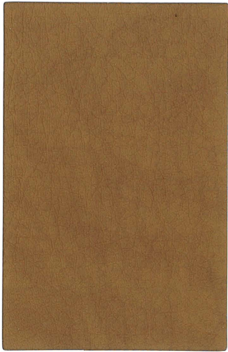
Moccasin MOC36 Saddle